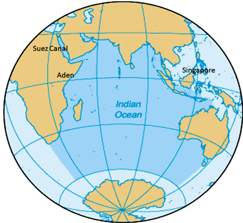
Map 1. British “East of Suez” Strategic Zone of Responsibility (post-WWII)

Source: Base map obtained from U.S. Geological Survey. http://neic.usgs.gov/neis/bulletin/neic_pcc3_1.html . Labels for Suez Canal, Aden, and Singapore work by author.