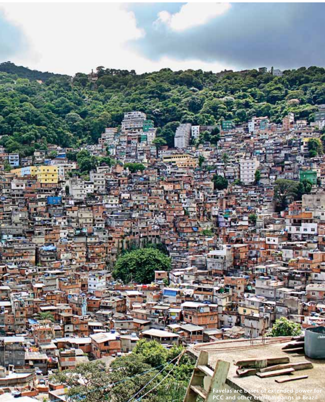
Favelas are bases of extended power for PCC and other criminal gangs in Brazil